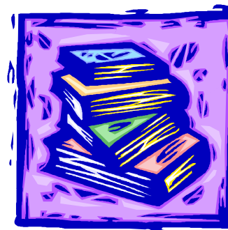
Be a reader

Keep it fun, for everyone. Keep your kids involved by asking questions about the story, and let them fill in the blanks. You can also create activities related to the stories you're reading.